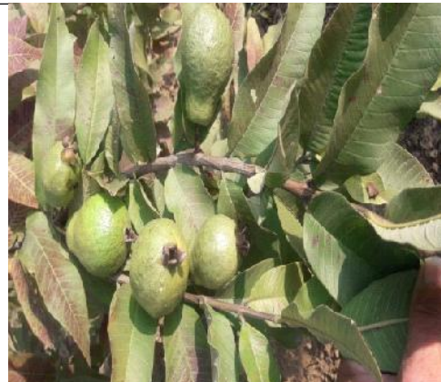
Fig. 1: Red flush guava at RRSS, Raya, SKUAST-Jammu

in the diabetes peoples. It in only fruit which gave twice fruiting in the year and its canopy can be very easily as its plants are thorn free. In China, peeled guavas are also taken to treat diabetes since the ancient times. The different components of guavas such as fruits, barks, leaves are beneficial against of bacteria such as Micrococcus pyogenes and Escherichia coli. Fruits extract of guavas are useful against Salmonella and also used as laxative. The folate of guavas is good for pregnant women as it prevents defects in new born baby. It is act like as alkanity inside the body. The alkaline properties of guavas are used in the treatment of acidity and hyperacidity. Guavas juices are helpful in releasing of toxins from the body, especially from the stomach. Guava extract's antimicrobial properties also help treat acne as they are effective in eliminating the bacteria that cause acne. Guava is highly useful for the treatment of blood pressure, hypertension and heart disease. Guava contains adequate fibre and also hypoglycemic in nature which helps to control