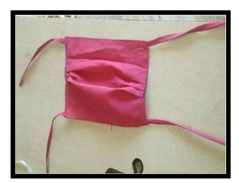
Rashtriya Krishi | Vol. 15 (1) | Jun., 2020