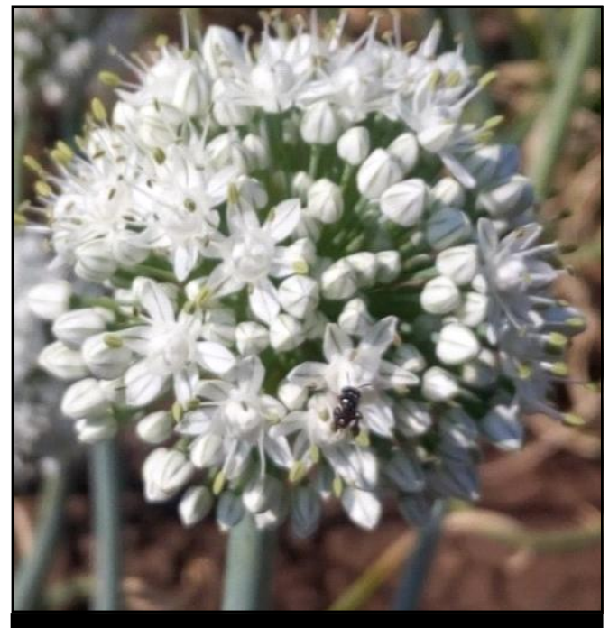
Fig. 1: Onion umbel

pollinator's management. The information and strategies provided with this chapter would be very much useful for seed growers to adopt sustainable approach in pest and pollination management.