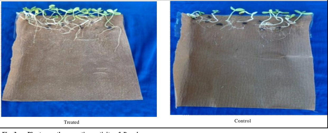
Fig. 3: Plant growth promoting activity of Pseudomonas

Previous work showed that many micro-organisms such as bacteria can had positive influence on plant growth and plant health as PGPR (Zakira et al. , 2009; Erdogan and Benlioglu, 2010; Kloepper et al. , 1980 and Dileep Kumar, 1999). The role of Pseudomonas spp. in promoting root and shoot growth of different crops has been demonstrated (Kamal et al. , 2008). The use of rhizobacteria against leaf blight of sunflower caused by A. helianthi not only suppressed the disease incidence but also increased growth parameters of the plant. This gives them an advantage over the use of chemical fungicides against leaf blight in disease management. The work has to be intensified