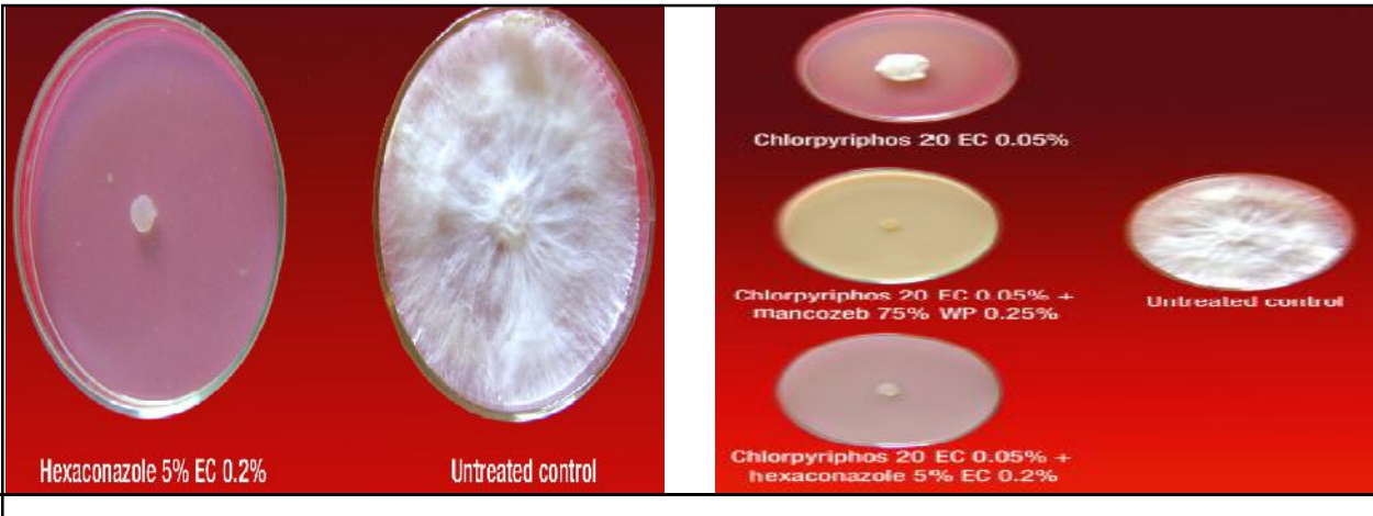
Plate2: Per cent inhibition of growth of Sclerotium rolfsii in the medium treated with mancozeb

Plate1: Pure culture of Sclerotium rolfsii