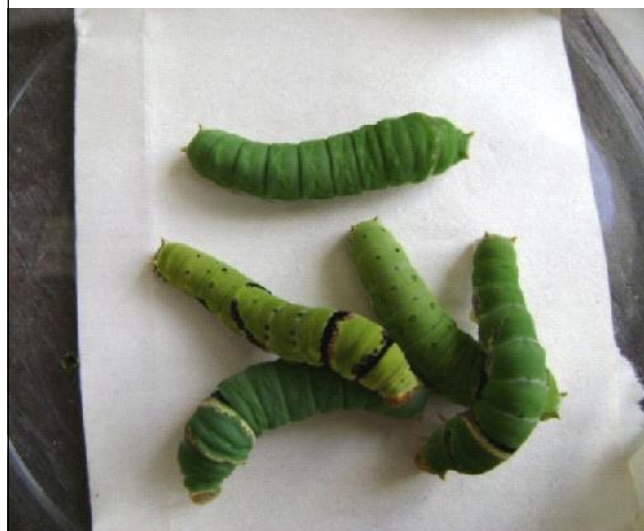
4 th and 5 th Instars