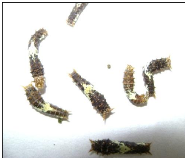
1 st , 2 nd and 3 rd Instars

Andrographis paniculata is an herbaceous plant