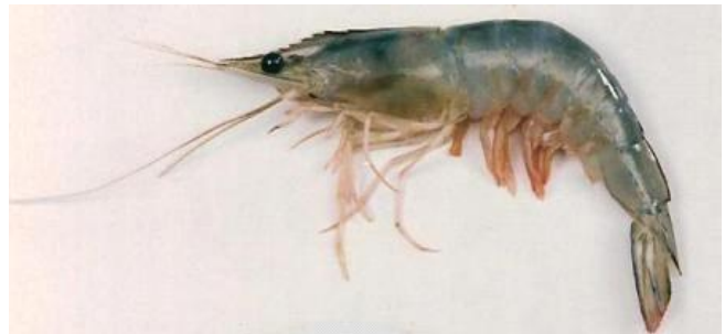
Fig. 6 : Penaeus indicus (Naran)

expenditure compared with normal rice cultivation. The major environmental concerns of loss of biodiversity, over exploitation of natural resources and coastal degradation are not present in this system. This system is an eco-friendly cultivation practice (Paimpillil, 2007).