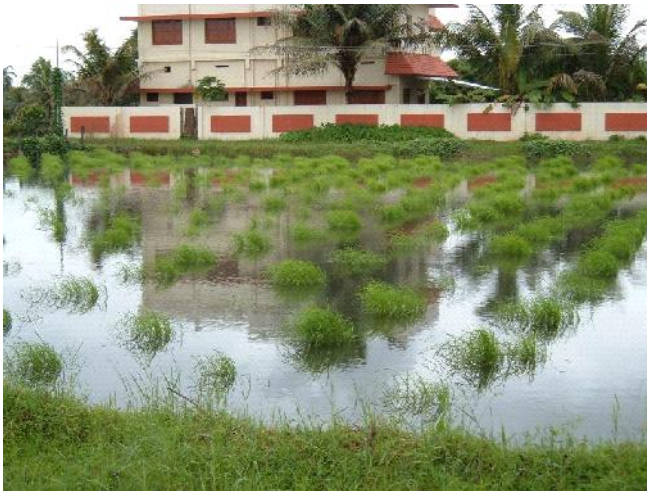
Fig. 2 : Established seedlings on the mounds. Paddy fields are reclaimed for construction of houses.