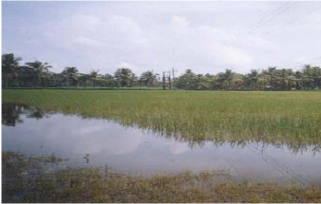
Fig. 4 : Residues of paddy field, natural food for prawns

fields and preventing the escape of fish from the field while maintaining maximum water exchange. Harvesting coincides normally at the time of low tides. The prawns and fish are caught in the sluice nets locally known as “thoombuvala” (Paimpillil, 2007). White prawns (Naran) and tiger prawns (Kara) are the major cultivated prawns (Fig. 5 and 6). Until the middle of April, prawns are harvested especially 2-3 days before the new and full moon days, as tidal activity has an impact on the movement of prawns. In general, during the low saline phase the paddy cultivation is done, whereas prawn cultivation is done during the high saline phase (Shylaraj and Sasidharan, 2005 and Francis et al. , 1999).