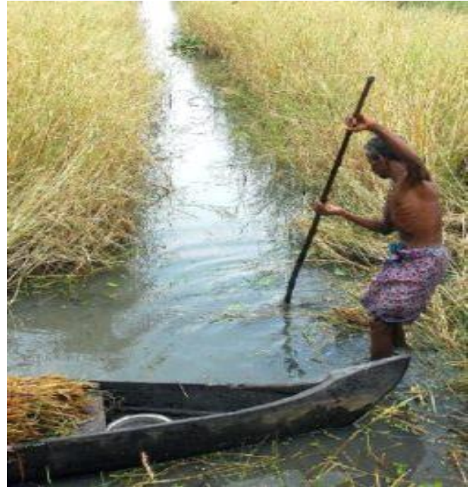
Fig. 3: Transporting the harvested Pokkali rice crop.

After the harvest of the crop, the pokkali fields are