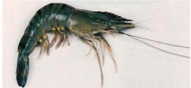
Fig. 5 : Penaeus monodon (Kara)

The best utilization of ecological cycle takes place in Pokkali fields making it environmental friendly. Absence of the use of chemical fertilizers and pesticides makes it an organic rice production system with less