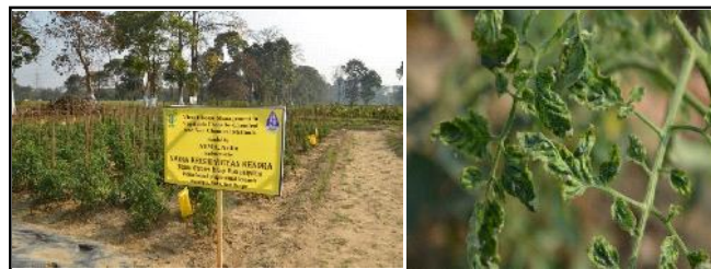
Plate A : Field at Central Research Farm of Bidhan Chandra Krishi Viswavidyalaya, Gayeshpur, Nadia, West Bengal, Leaf curl virus symptom