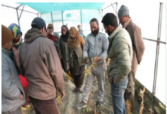
Fig. 1 : Missing