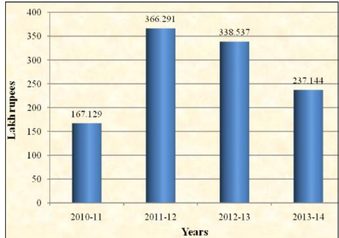
Fig. C : Availability of funds under horticulture mission for North East and Himalayan states (Kashmir Division)

At the end of the last five year plan, Government has put in place the requisite level of investment in infrastructure and logistics that need to be further built upon and strengthened in the current financial plan. There is a need to consolidate the gains made so far by investing in critical areas to make further sustainable long term growth.