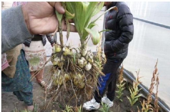
Fig. 2 : Missing