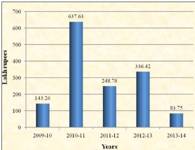
Fig. B : Availability of funds under RKVY in floriculture (Kashmir Division)

sponsored schemes to growers has propped the fledgling commercial flower production in J&K with the help of subsidies from centrally sponsored schemes like Horticulture Technology Mini Mission, RKVY etc. Department of Floriculture that was previously known as Department of Gardens and Parks entrusted with the upkeep of gardens and public recreational spaces underwent a radical revamp in 2007. Government was able to create a primary extension and development apparatus in the districts that was instrumental in kick-starting floriculture in different districts of J&K.