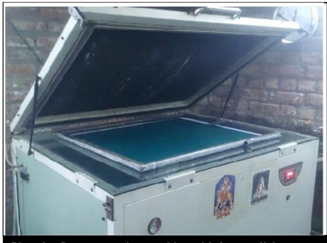
Plate 2: Screen exposing machine with bottom light source

The photo emulsion was applied on the screen mesh. Photo emulsion is thick liquid substance which reacts to light. Essentially, photo emulsion becomes "tougher" when exposed to light, making it more difficult to remove from surfaces. The parts of the stencil that were required to keep solid, were exposed to the light and then the rest was washed away with lukewarm water until image was fully open. The developed screens were then air dried or in sunlight.