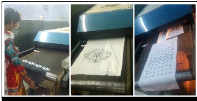
Plate 5: Curing in process

After the printing, curing was done at 180°C for 150 seconds.