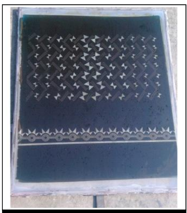
Plate 3: Developed screen

Mesh fabric tight with frame Applied photo emulsion on the mesh and dried in air. Placed design paper under the mesh. Light passes through the design paper and mesh fabric for 3-4 min. Remove the emulsion from the design area by water spraying. Cleaning Drying