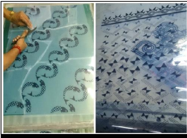
Plate 1: Printout of design on film sheet

prepare the screen stencil. After transferring the designs to a film, these were attached to the screen mesh, which were photo chemically processed on the screen fabric by screen exposing machine.