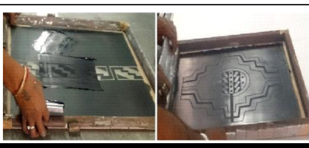
Plate 4: Printing of Design G, and L, in process

- 2% - Thickener (tkf) 8% Printing Ink added to the above paste (K4 black