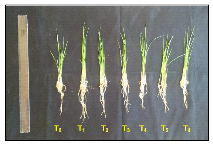
Plate 1 : Effect of pre-sowing seed hardening enhancement treatment on initial seed quality in rice cv. ADT 36

The increased dry matter production recorded by T_1 over the control might be due to simultaneous effect of repair mechanism induced by hardened and synchronized earlier germination that makes seedling entry into the autotrophic state well in advance to produce