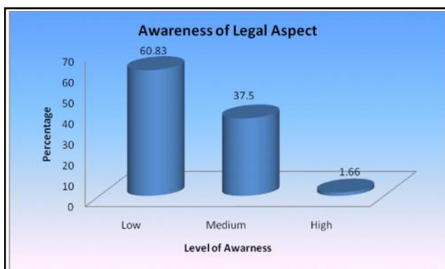
Fig. 4 : Percentage distribution of overall awareness level of women in legal aspect

The overall picture generated from Fig. 4 envisages the awareness level of women with legal aspect. Majority (60.83 %) of women explicated that they were having low awareness level with legal aspects including less education, low societal exposure, lack of self-confidence, absence of trust, less attachment and affection while 37.05 per cent women reported that their awareness with legal aspect was medium. Nadda et al. (2018) suggested that there is need to create awareness about the law against domestic violence in the women folk. Not only the awareness about the law would suffice but also the provision of shelter homes and vocational bodies for the victims of domestic violence is equally important.