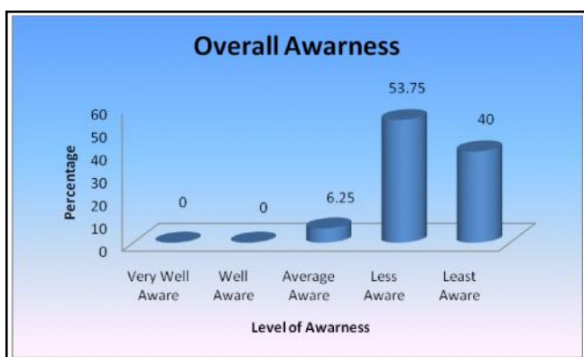
Fig. 1 : Percentage distributions of women about overall awareness level regarding Domestic violence

Fig. 1 portrays the overall awareness level of women in domestic violence. Majority of women (53.75%) were having less awareness of domestic violence (aspects included as- self aspect, family and social aspect and legal aspect) while 40 per cent been least aware. Only 6.25 per cent women were having average awareness regarding domestic violence. It can be concluded that beside cultural practices there are many important social, political, and economic factors which affect women's lives. These include poverty, inequalities, new articulations of patriarchies in specific regions and the legacies of colonialism and racism. WHO report (2013) revealed that Africa, eastern Mediterranean and South East Asian countries are advanced in physical/sexual violence with intimate partner. America is next higher region. Prevalence of violence is low in Europe and western pacific regions due to high income and sensitivity in society.