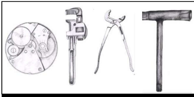
Fig. 1: Sketching of different tools