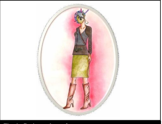
Fig. 4: Design style no. 2