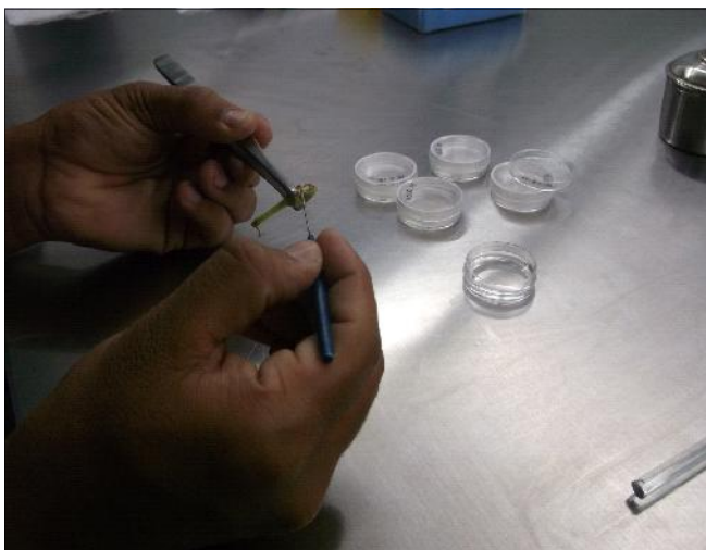
Fig. B : Aseptic extraction of cotton ovules from ovary