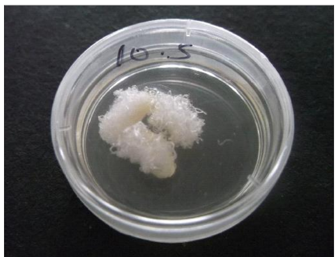
Fig. D : Growth of cotton ovules and fibres after 21 days