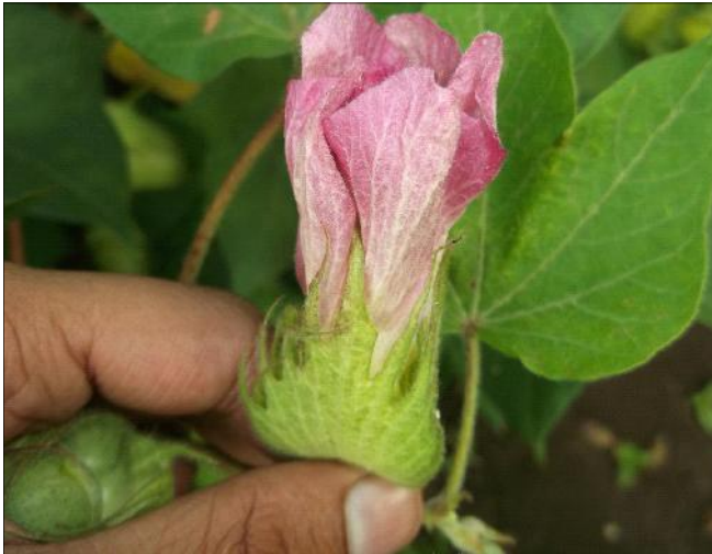
Fig. A : Collection of 2 DPA cotton flower