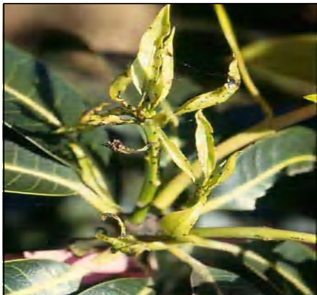
Fig. 2 : Symptoms on twig