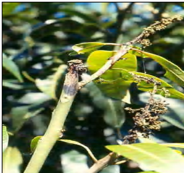
Fig. 3 : Symptoms on stem