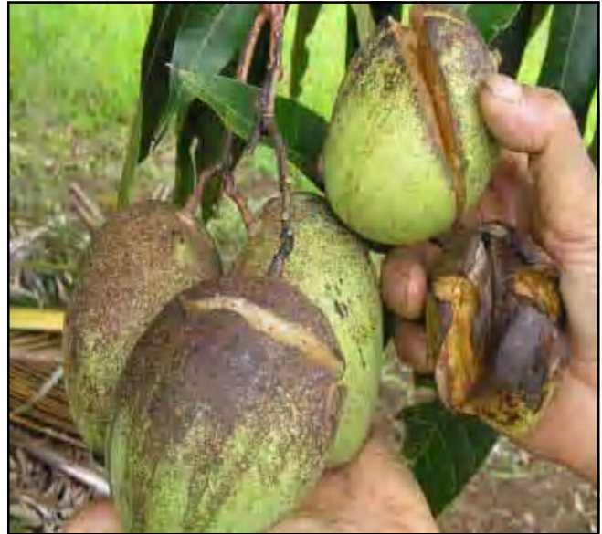
Fig. 7 : Cracking of epidermis

cracking (Fig. 7) of the epidermis, leading to an “alligator skin” effect (Fig. 8) and even causing fruits to develop wide, deep cracks in the epidermis that extend into the pulp.