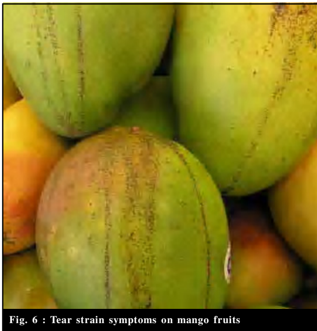
Fig. 6 : Tear strain symptoms on mango fruits

A second symptom type on fruits consists of a “tear stain” symptom (Fig. 6) in which are linear necrotic regions on the fruit that may or may not be associated with superficial