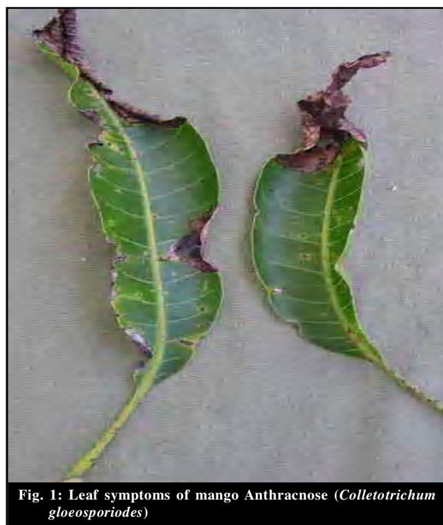
Fig. 1: Leaf symptoms of mango Anthracnose ( Colletotrichum gloeosporioides )

On leaves, lesions start as small, angular, brown to black spots that can enlarge to form extensive dead areas. The lesions may drop out of leaves during dry weather (Fig. 1).