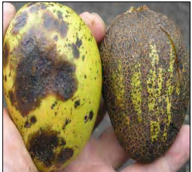
Fig. 8 : Alligator-skin effect on fruits

Lesions on stems and fruits may produce conspicuous, pinkish-orange spore masses under wet conditions. Wet, humid, warm weather conditions favor anthracnose infections in the field. Warm, humid temperatures favour post harvest anthracnose development.