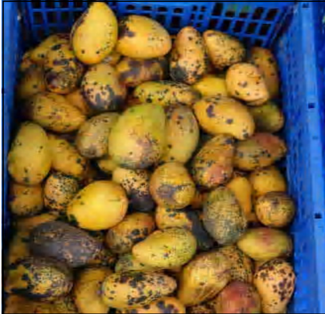
Fig. 5 : Symptoms on ripe fruits

green fruit infections remain latent and largely invisible until ripening. Thus, fruits that appear healthy at harvest can develop significant anthracnose symptoms rapidly upon ripening (Fig. 5).