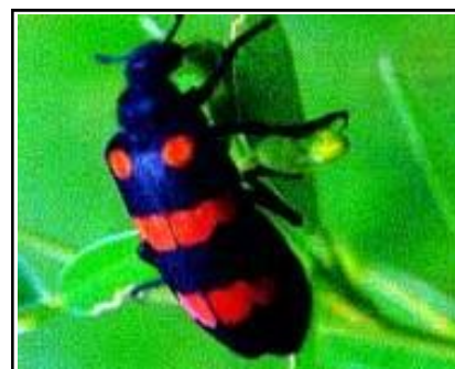
Fig. 5 : Blister beetle