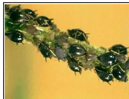
Fig 3 : Aphid colony on redgram