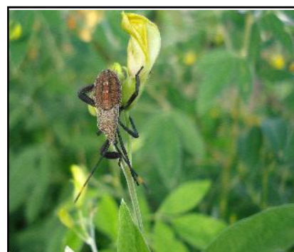
Fig. 4 : Pod bug