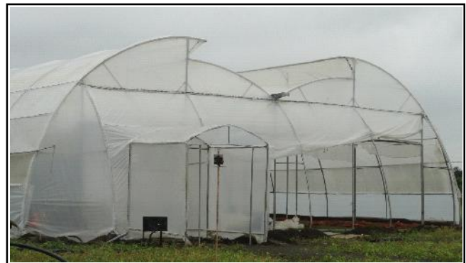
Fig. A : Double arch, naturally ventilated greenhouse

Engineering, Bhopal, Madhya Pradesh. The greenhouse under study is a double arch, naturally ventilated greenhouse with 560 m 2 floor area (Fig. A).