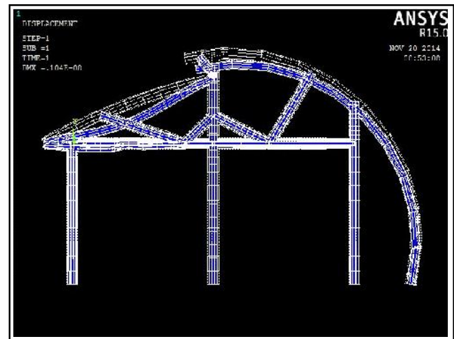
Fig. 1 : Deformed (blue) and unreformed (white) shape of the frame

where C_{pnet} = net roof pressure coefficient = C_{pi} - C_{pe} , V_z =