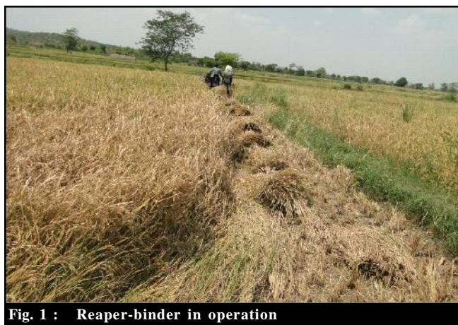
Fig. 1 : Reaper-binder in operation

of 3.6 kmph. The fuel consumption was observed as 5.27 l ha -1 whereas the effective field capacity for conventional method of harvesting by sickle was observed as 0.025 ha h -1 . The results are presented in Table 2 and the operation of reaper-binder is shown in Fig. 1.