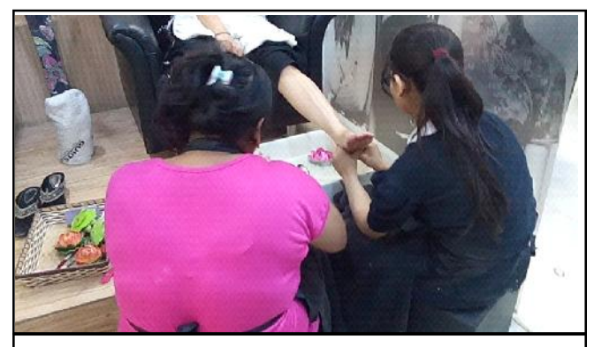
Posture II: Respondent performing pedicure by sitting