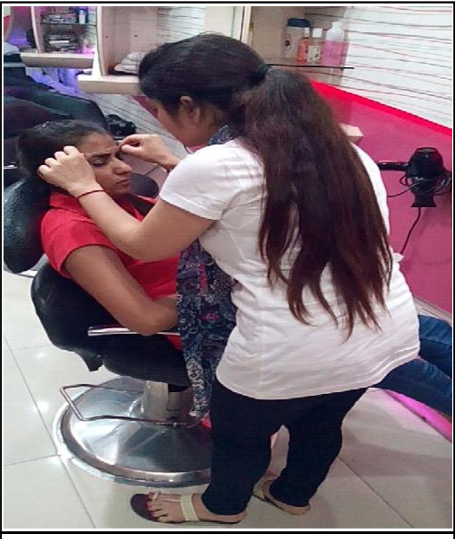
Posture III: Respondent performing threading by standing

The posture taken by the respondents in three different activities were analysed such as waxing, threading and pedicure. The results of the same are presented below: