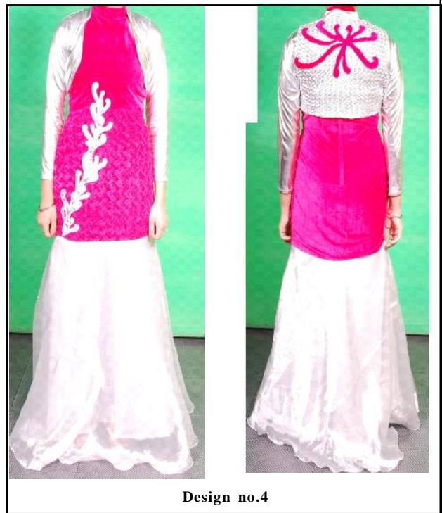
Fig. Design specification :