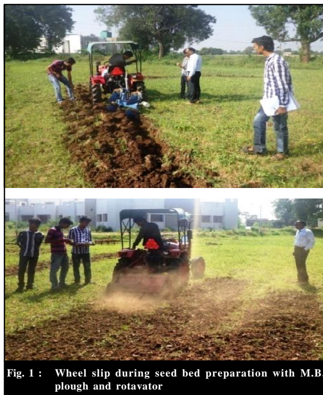
Fig. 1 : Wheel slip during seed bed preparation with M.B. plough and rotavator

The results of the draft measurement derived from