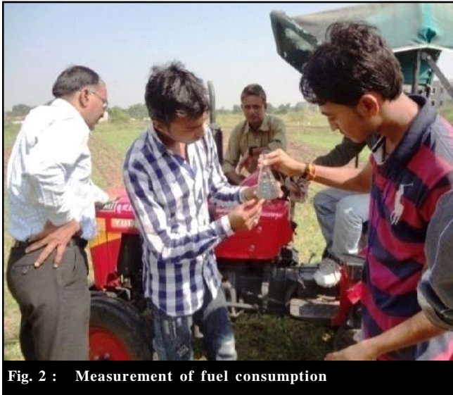
Fig. 2 : Measurement of fuel consumption