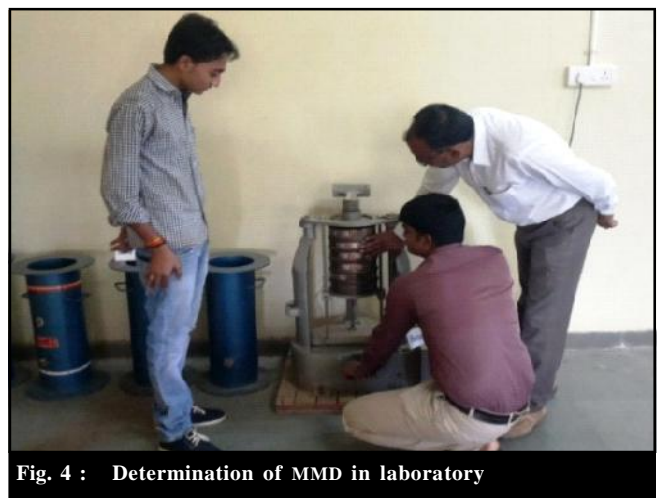
Fig. 4 : Determination of MMD in laboratory

Singh and Panesar (1991) concluded that the clod mean weight diameter (MWD) has been considered as an index for indirect measurement of soil tilt during seed bed preparation. The clod mean-mass-diameter is an index for indirect measurement of tilth of soil. It has been indicated that soil aggregates of size 12 to 14 mm in the final seedbed were adequate for sowing crops. This result is in agreement with the findings of Singh et al. (2002). The observed data for MMD under T 1 , T 2 , T 3 and T 4 was 16.85 mm, 18.41 mm, 10.32 mm and 12.95 mm, respectively (Fig. 4 and 5). There is a considerable improvement in soil pulverization with the use of the rotavator due to the ability of rotating blades to make fine particles by the forward motion of the machine. This findings correlates with the results obtain by Hughes and Baker (1977) who compared traditional plough, rotary cultivation and no tillage in a silt loam soil and found that the rotary cultivation treatment resulted in the greatest proportion of soil in the smaller aggregate size fraction at all sampling dates.